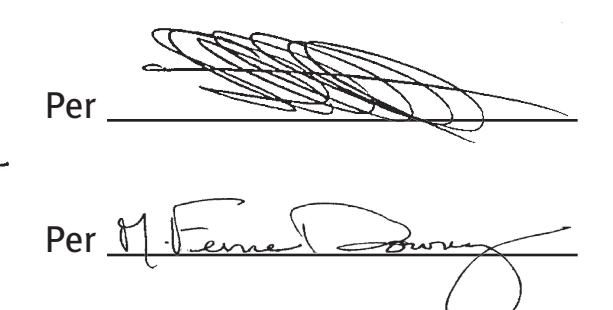
Canadian Media Production Association